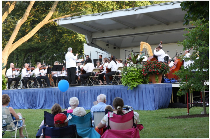
Middletown Symphony Orchestra performs at Woodside Cemetery and Arboretum on Labor Day at a free outdoor concert.

Midfest International spotlights a different country each year for the weekend event—Indonesia is the 2009 country.