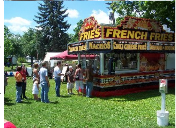
SnoKones, Cotton Candy, Nachos

* Only non-alcoholic beverages sold in booths—except Beer Booth